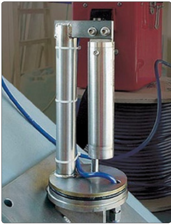
□ Model 6350 installation using a custom mounting bracket designed for concrete face rock fill dam applications (shown with protective cover removed).