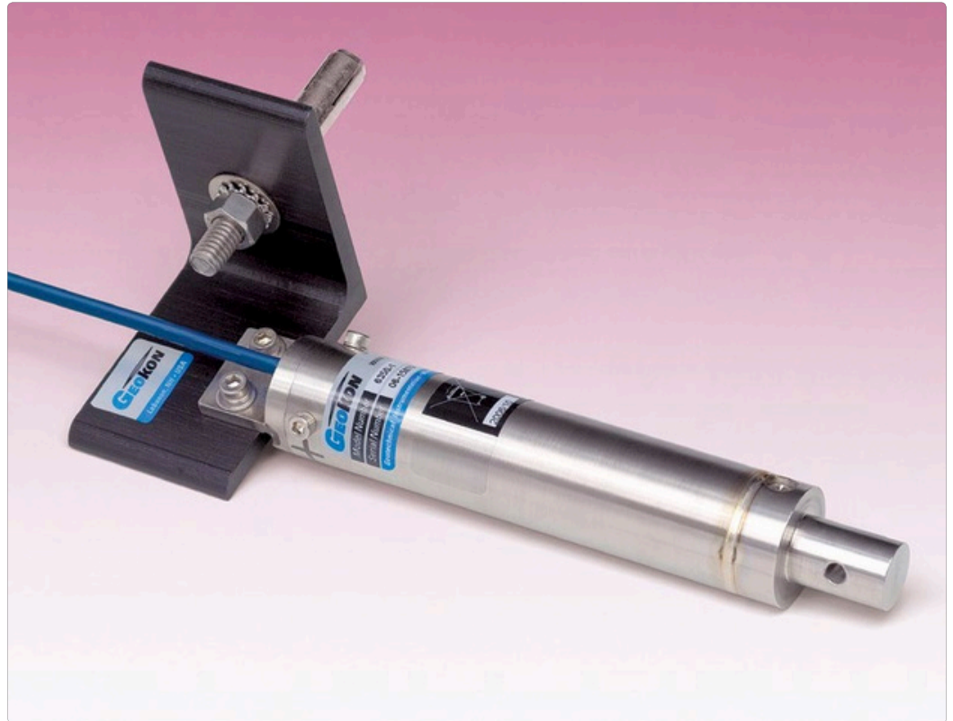
□ Model 6350 Vibrating Wire Tiltmeter shown with mounting bracket assembly.