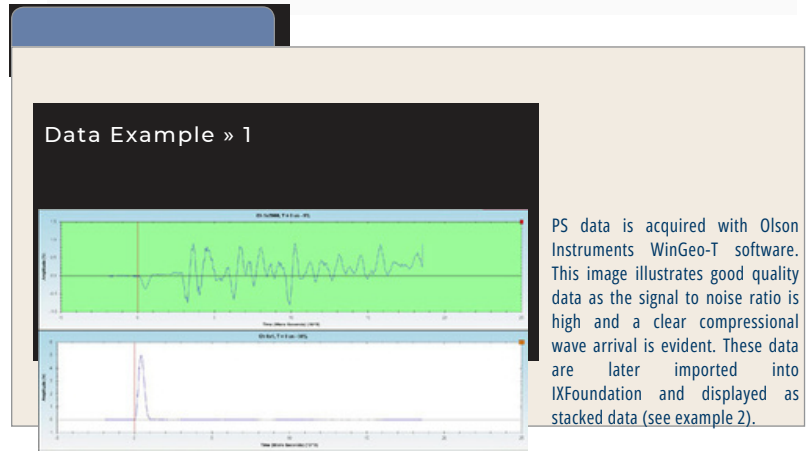
PS results showing good quality data