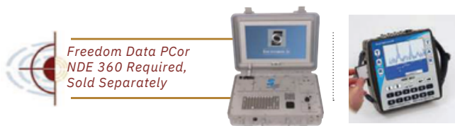
Freedom Data PC or NDE 360 Required, Sold Separately