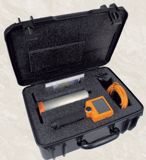
Transport case with Gamma Surveyor Vario and standard accessories