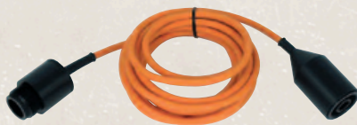
5 m borehole cable