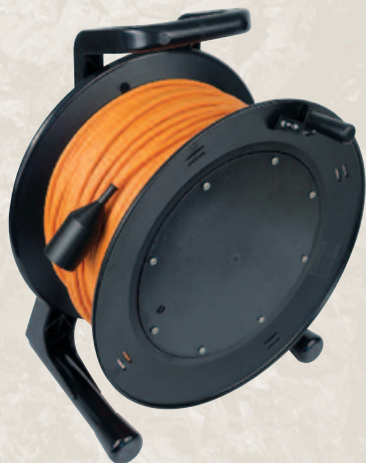
100 m borehole cable