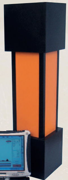
Probe GS CAR NaI(Tl) 4"x 4"x 16"