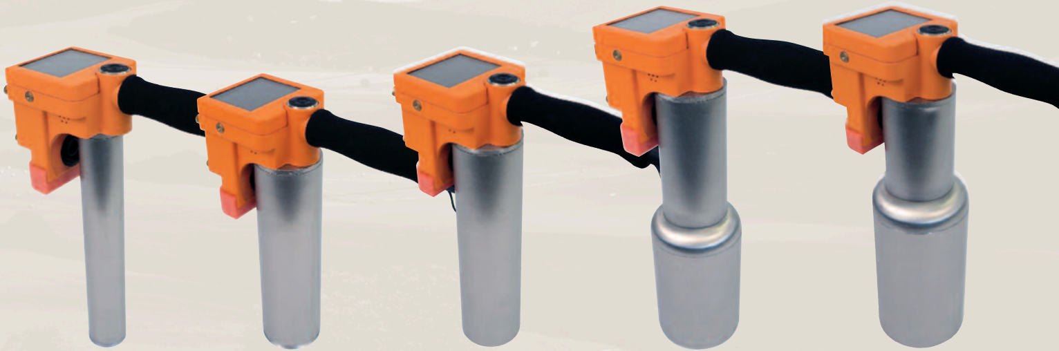
Probe VB1 BGO 1"x 1.5"